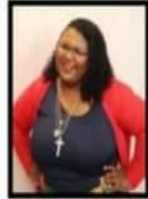
Comedienne K Mack